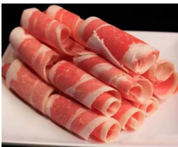
Thin Cut Ribeye Steak