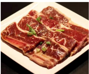
Beef Short Ribs