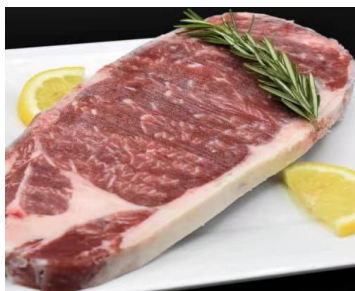
New York Steak